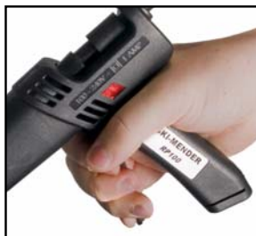
Full length easy to use trigger & slim profile handle