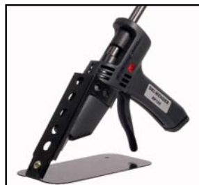
Stable metal stand for safe storage of the repair pistol