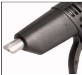
Special flat head cast-in nozzle