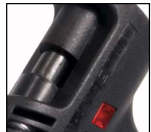
Open breech area to allow easy cleaning plus power-on warning light

FOR OUR FULL PRODUCT RANGE PLEASE VISIT OUR WEBSITE www.poweradhesives.com